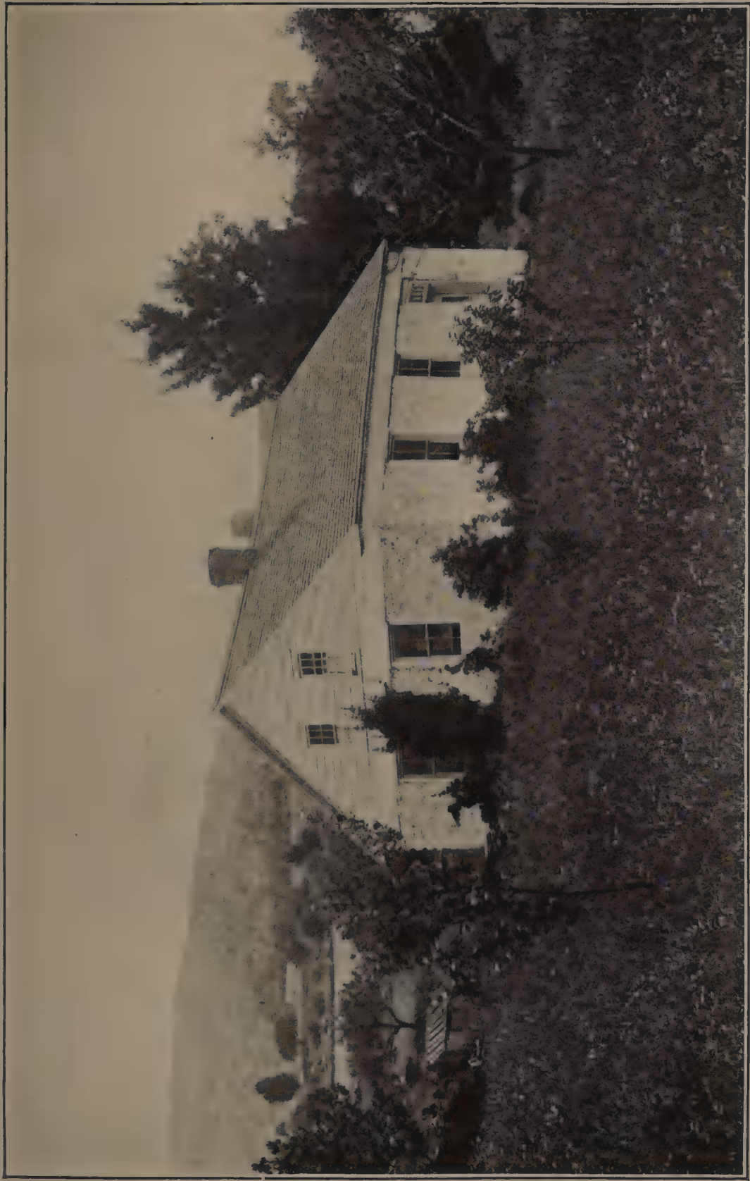
THE OLD SCHOOLHOUSE, ROXBURY, N.Y.